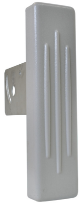
PS Series Sector Antenna