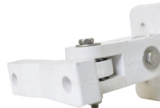
Optional Wall Mount Bracket